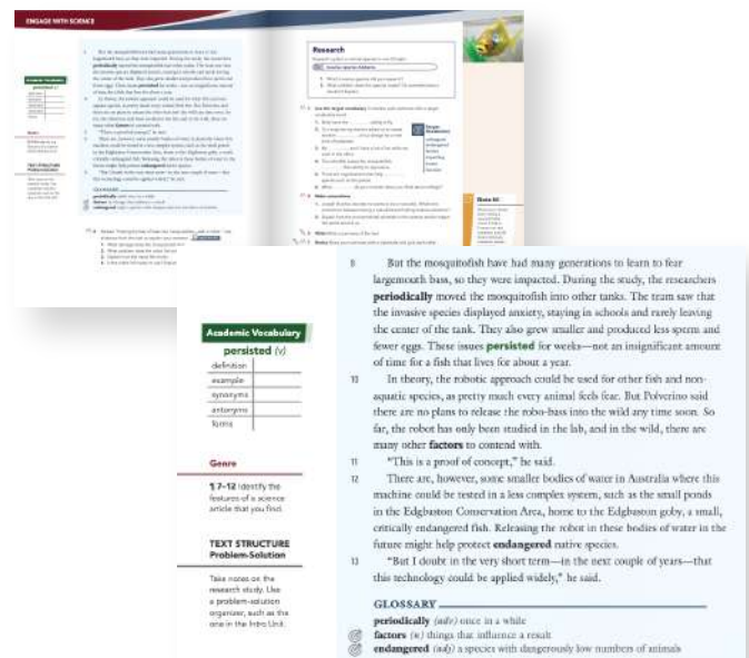
Engage Level A, Unit 1